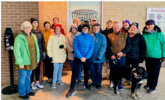
First Congregational crew on the NAMI WALK for Mental Health.